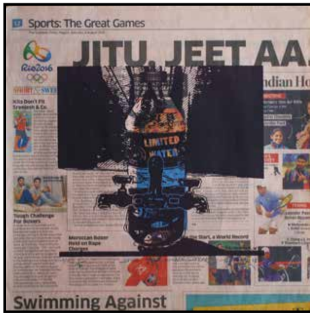
Chandrashekhar Tandekar INDIA

The Images goes as close as to reality, it feels unrealistic, and as it goes away from reality it start reacting independently but still it remain unrealistic, and thats when the actual subject starts.