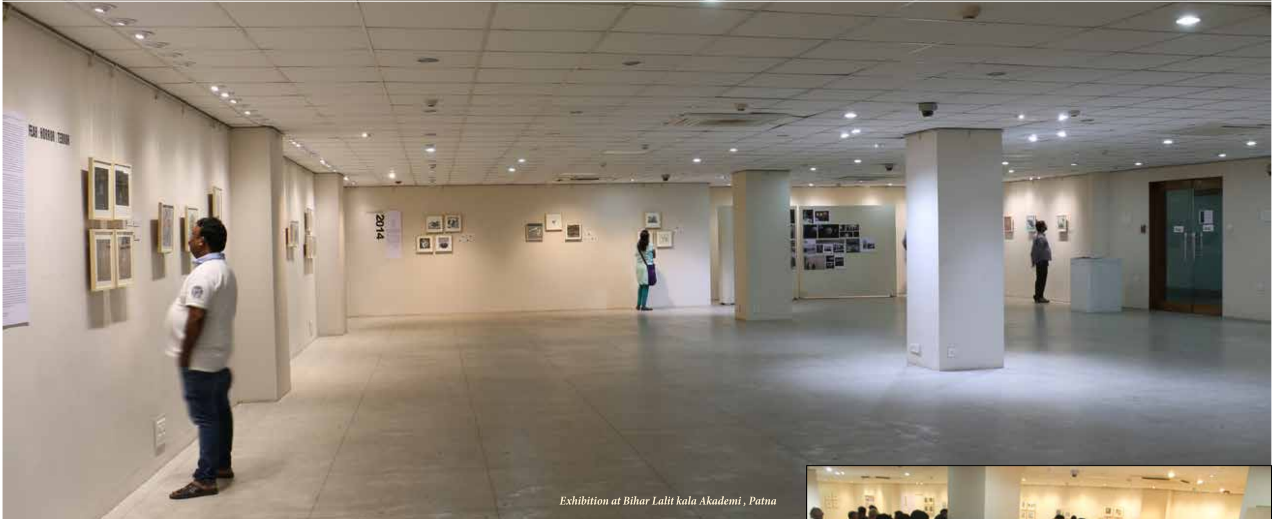
Exhibition at Bihar Lalit kala Akademi, Patna