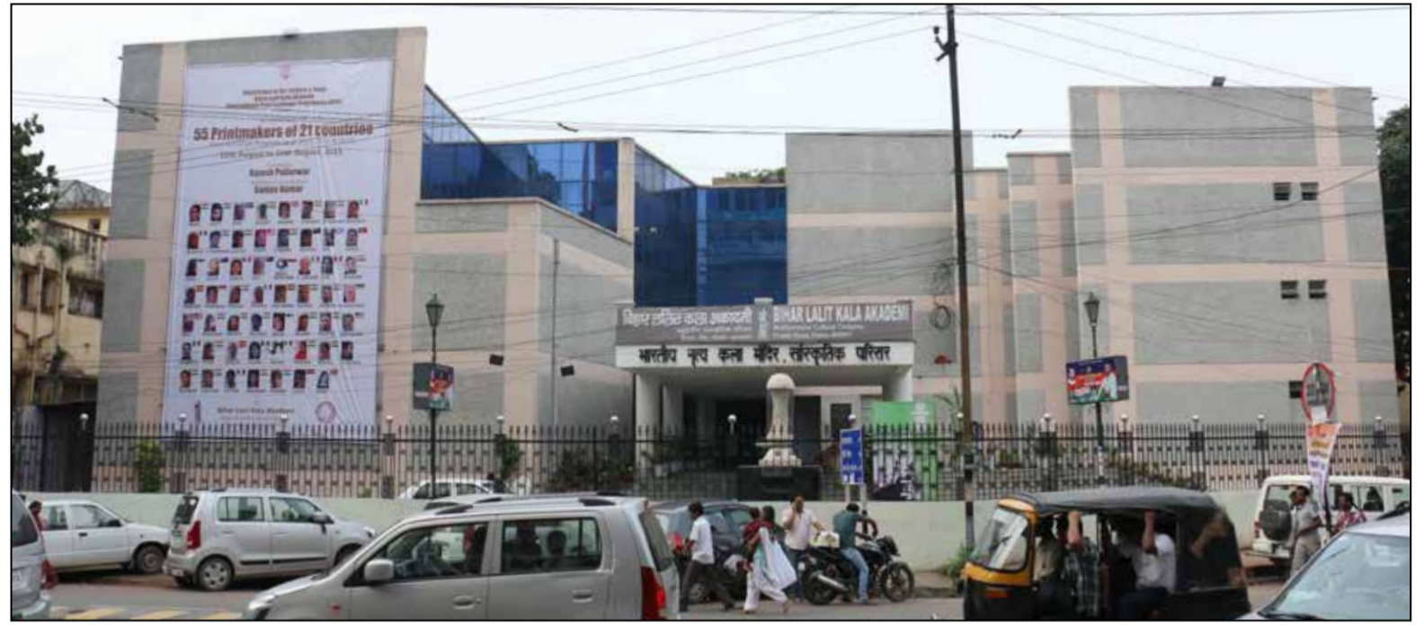
Gallery of Bihar Lalit kala Akademi , Patna

of the chaotic and troubled metropolis Mumbai (India). "Breaking News" collectively intervene the parody of political satire as common ground of experiencing crisis in contemporary times, wherein the artists choose to be dark and silent within one. May it be Sameer Rao's art-work from India or Badawy's art-work from Egypt, the converging human desire for peace and