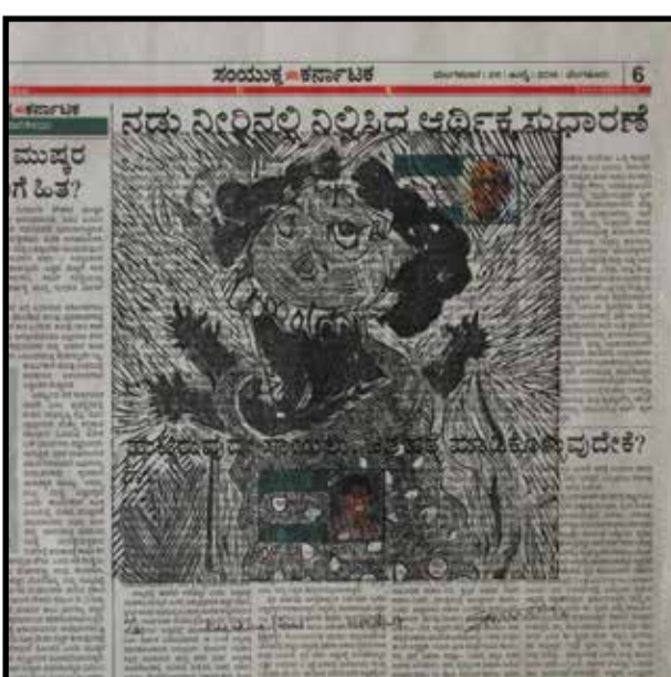
Sameer Rao INDIA

The image through which I want to represent "BREAKING NEWS" is a surprised human figure with exaggerated oversized open