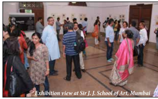
Exhibition view at Sir J. J. School of Art, Mumbai

2015 portfolio. Unlike other exhibitions, it is a Non-Profit endeavor to flourish passion for printmaking. Since past two years Chatterjee & Lal Gallery